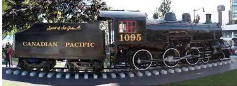
Volume 1 / Issue 1: January 2017